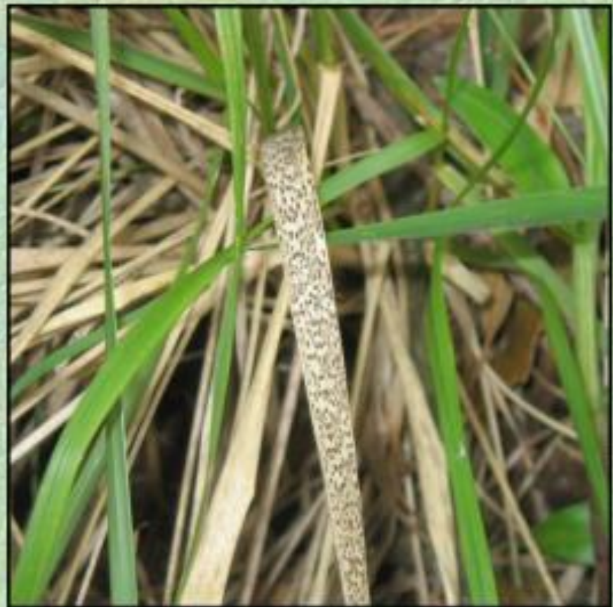
Telia on N. neesiana (site NT 16)