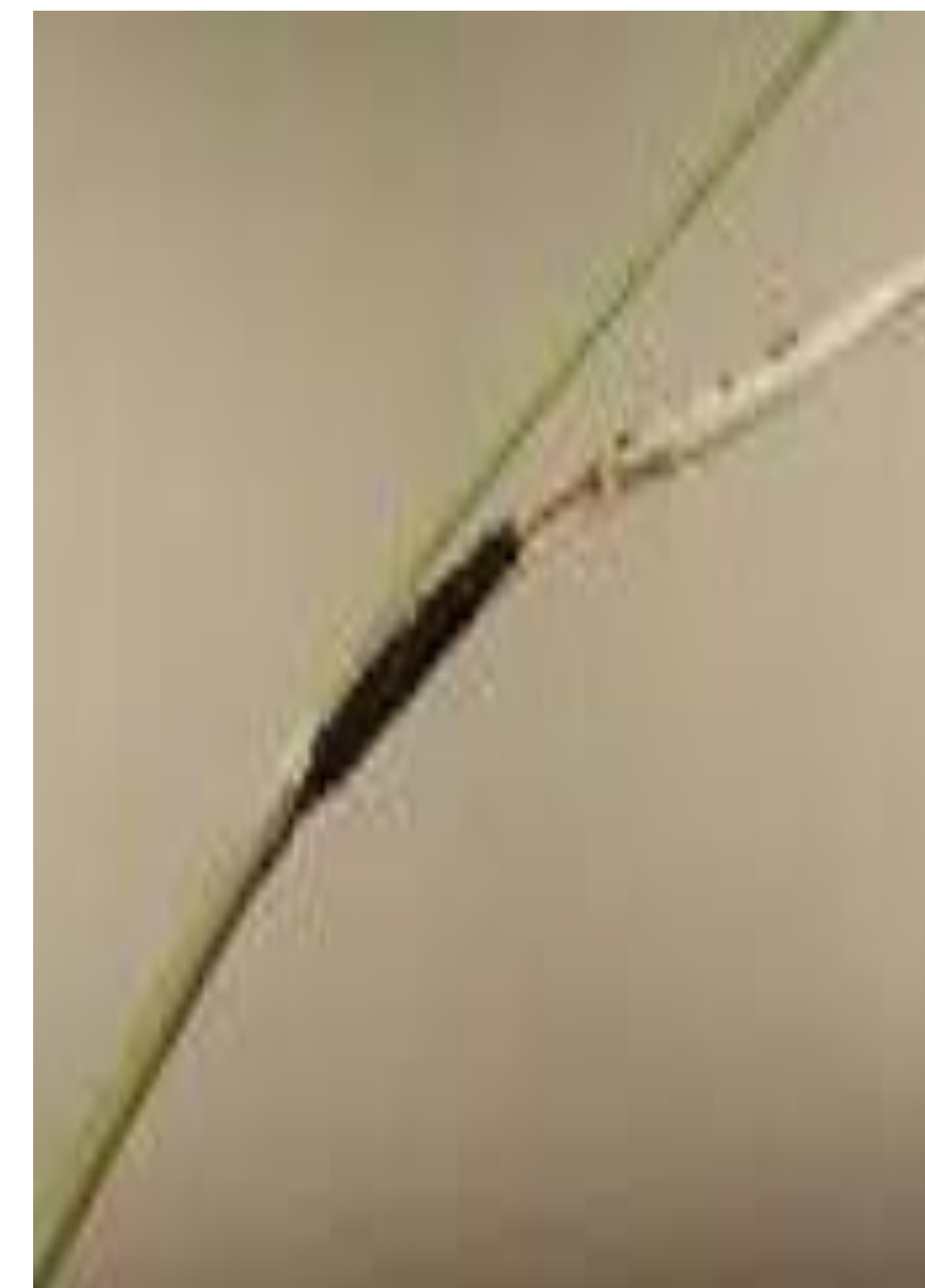
smut fungus infecting NT seed head in South America