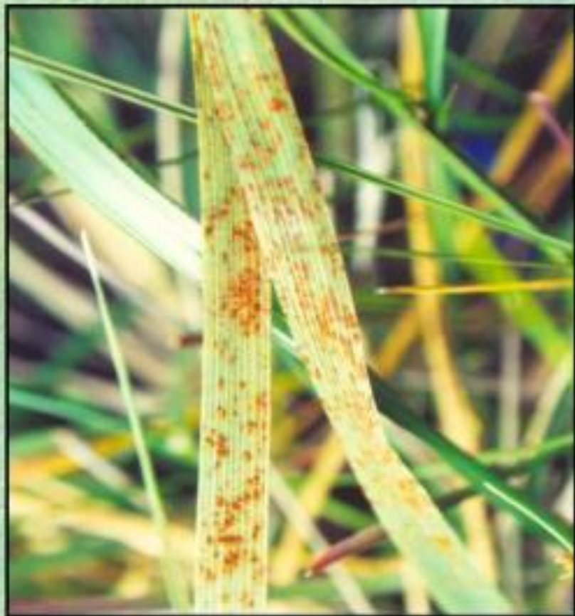
Uredinia on N. neesiana (site NT 27)