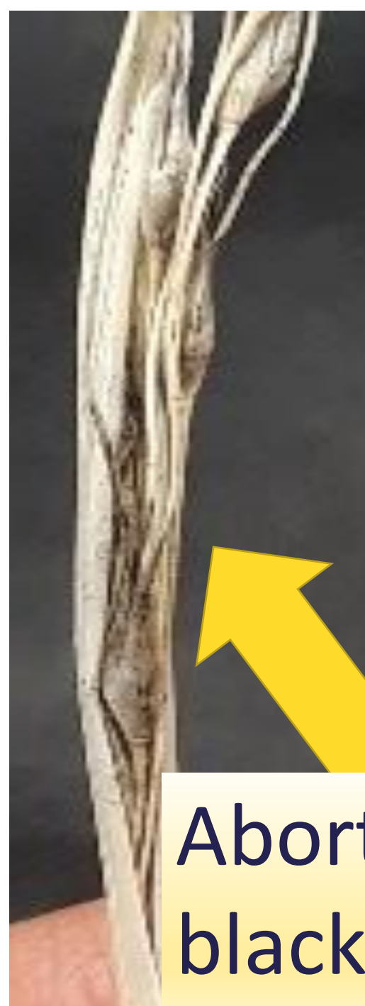
Aborted seed, black "spots"