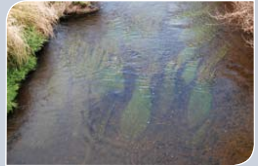
Clean green rooted plant without algal cover (slime) is good.