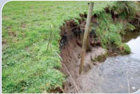
Stream bank erosion – plan to reduce slope and plant