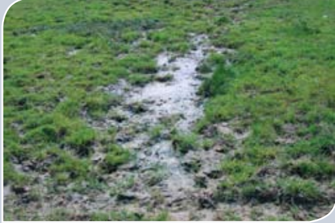
Ponding or run-off – the irrigator needs to be turned off.

IT'S ABOUT NOTICING POTENTIAL FOR EFFLUENT LEAKAGE TO WATERWAYS