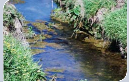
A slimy warning of leakage – algae taking over the stream habitat.

IT'S ABOUT CHECKING OUR SMALL TRIBUTARIES