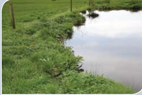
Ponds leaking or overflowing, seek advice and plan for a system upgrade.

IT'S ABOUT THINKING, PLANNING AND ACTING