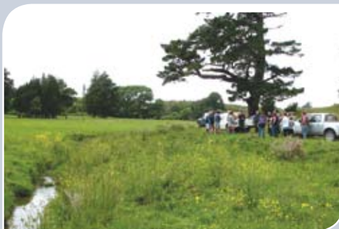
Wetland areas act as the kidney's of the farm.