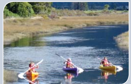
Habitats for us to play in and enjoy.