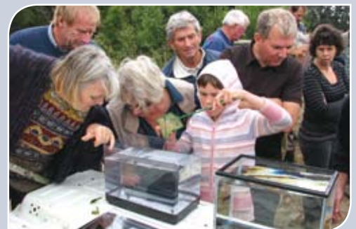
Habitats that support streamlife.