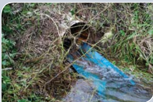
Restoring fish passage for our whitebait.