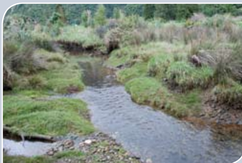
These areas allow for sediment build-up and nutrient filtration.