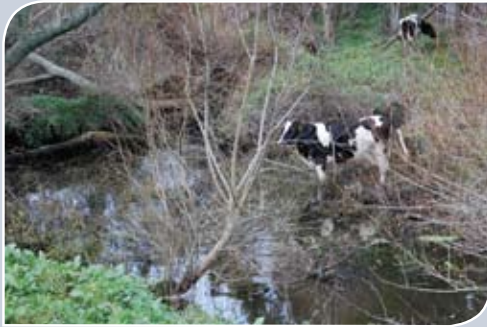
Cows are in waterways – they need to be moved.