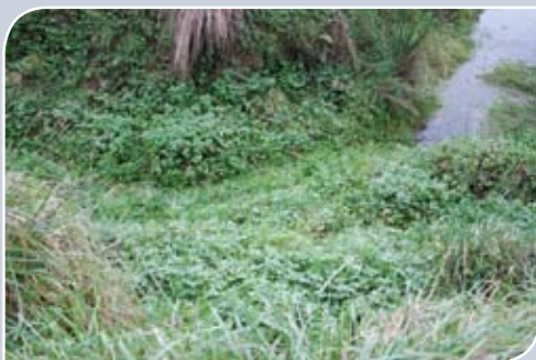
Drains full of clean rooted plants improve water quality and habitat.