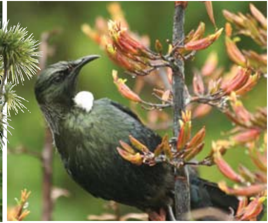
Planting kowhai, karamu and flax provides food for native birds such as the Tui.