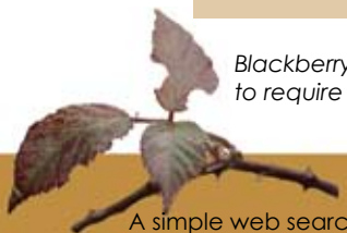
Blackberry establishes rapidly and is likely to require on going maintenance