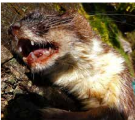
Stoat jaws!

In general mustelids are difficult to trap, and only trapping to a high standard will bring about increased survival rates of birds. Keep a watchful eye out for them and their tracks and droppings. Input from an experienced mustelid trapper can be very helpful when setting up your programme.