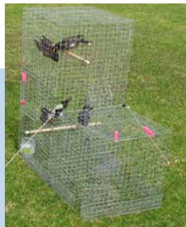
'Pee Gee' continuous-flow Indian Myna trap.