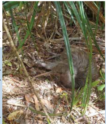
Kiwi in Leg hold trap.