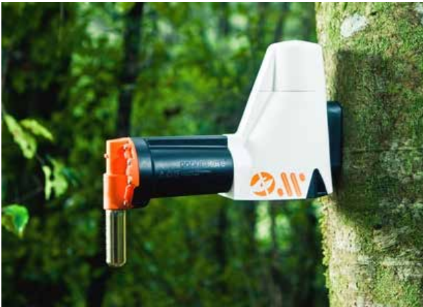
'Henry' possum trap

The Goodnature self-resetting possum trap is another tree mounted kill trap. The trap is powered by a CO 2 cylinder which can 'fire' approximately 12 times. An automatic lure drips onto a bait clip to attract possums. Counters are available as attachments to measure the number of kills. While available for purchase, these traps are still being refined in field trials. Henry traps are available from www.goodnature.co.nz