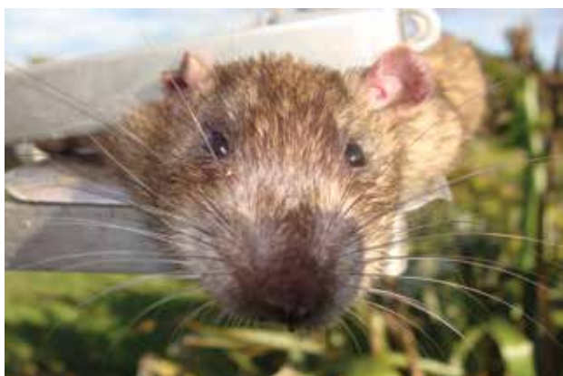
Rat in trap

Rats prefer areas with water and good food sources. Northland forests, with the large number of different types of fruiting native trees and numerous stream systems are ideal for rats!