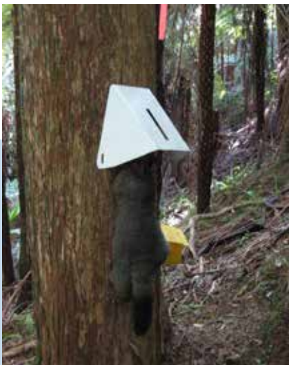
Sentinel in use by Whareora Landcare

Live capture traps such as leg holds, and cage traps can be effective for those who don't mind dispatching live animals and are able to check the trap within 12 hours of sunrise every day as legally required. Victor #1's are the most preferred and legally compliant leg hold trap. Remember that all leg hold traps need to be raised 700mm kiwi zones as kiwi have died after being caught and injured in these traps.