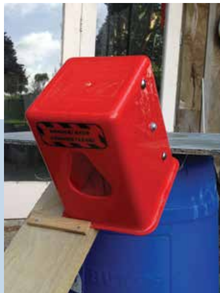
Hupara Landcare raised Timms trap sliding