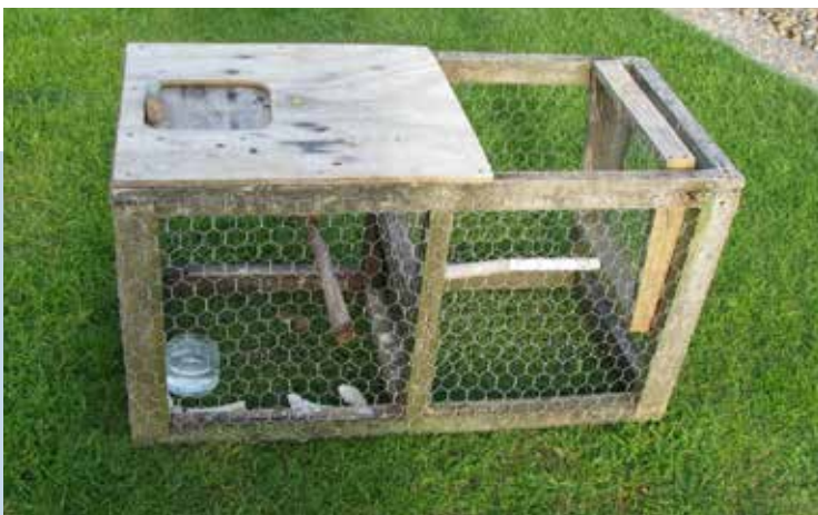
'Larsen' single-capture, split-perch Magpie/ Myna trap.