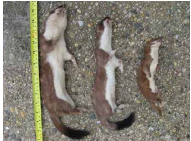
Animal on right is a weasel, other two animals are stoats – note the bushy black tail of the stoats.