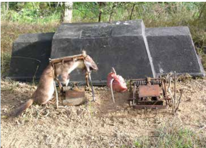
Stoat caught in Fenn trap