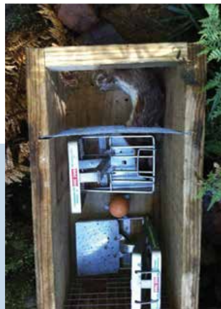
Stoat in Double DOC