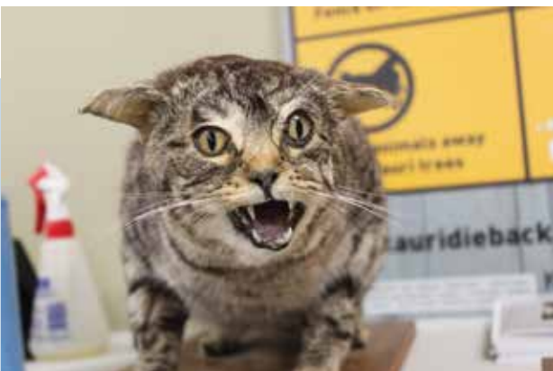
Stuffed feral cat.

Some secondary kill of cats can occur following targeting of large rodent and possum populations with 1080 or brodifacoum.