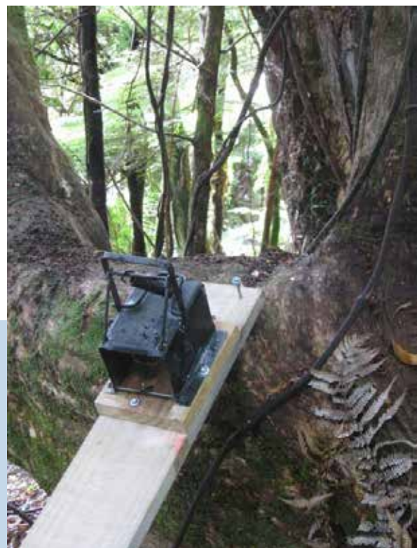
Steve Allan Feral Cat Trap.