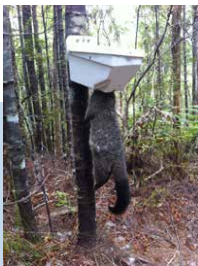
Trapinator in use by Bay Bush Action, Opua