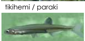
tikiheimi / paraki